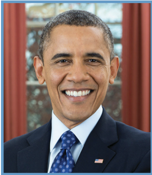
President Barack Obama