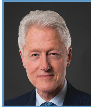
President William J. Clinton