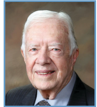
President Jimmy Carter